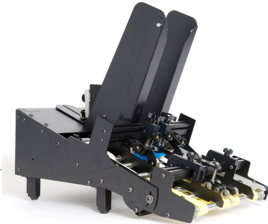
D-12 Demand Feeder

Our D-12 and D-20 line of friction feeders are the solution to your single shot AND continuous feed applications!