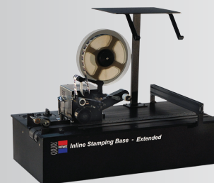
Inline Stamping Base – Extended