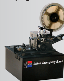
Inline Stamping Base – Standard

The Inline Stamping Base w/Print One is the complete package to affixing stamps and printing "Mailers' Precancelled Permit", just affixing stamps or just static printing all in a single pass. The extended base has our Print One Fixed Image Printing System and is a very cost effective solution for static printing fixed images or text. Using standard HP 45 inkjet cartridges, printing is easier and more affordable than ever. Simply download your image or text from your PC or laptop to the 1" print head and you're ready to print.