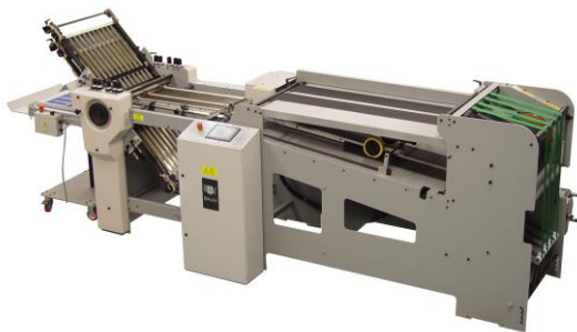
BAUM 20 CFF

We have retained the same proven features of the previous model including: